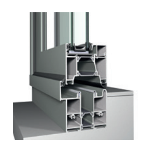
Double weather seal