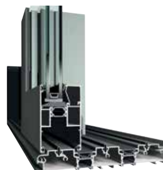
CP 130-LS 3-rail Low threshold