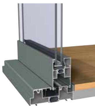
Flush floor integration