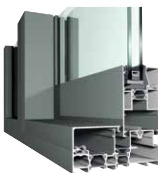
CP 130 Monorail Outside glazing